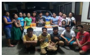
Bacolod Deaf Dorm