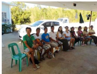
Zambo Immanuel Church for the Deaf 2016