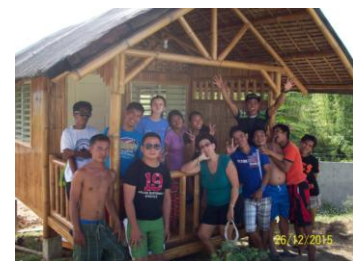
Christmas party 2015