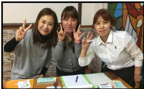
Enjoying the celebrations in Incheon