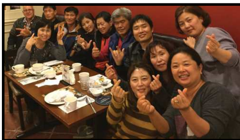
Group from Chuncheon

been helped years before. This really touched me.