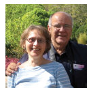
International Director & Missionary