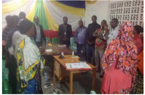
Church members fasting and praying

One of the Tanzanian churches for the Deaf spent forty days fasting and praying after suffering persecution from the community. They were praying for protection from those who believed that what they were doing was a waste of time. The outcome was that, at the end of their forty days, the police captured an Islamic group (who were living next door to the church) who had been killing people in north eastern Tanzania. The church is so thankful for the way that God answered their prayers in such unsettling times.