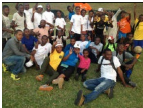
Group who have been fasting and praying