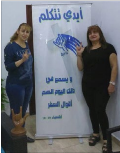
Centre for the Deaf

skills and sign language. We also help them realise their natural talents and encourage them to use them in their everyday lives.