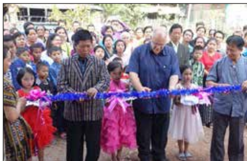
It is official - cutting of the ribbon