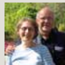
International Director & Missionary