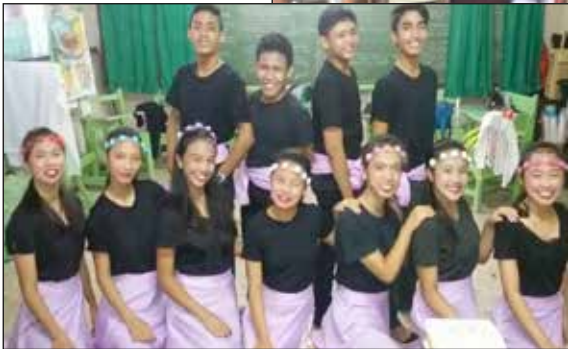
Deaf Awareness Week celebrations