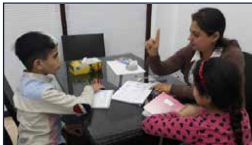
Teaching children sign