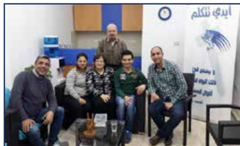
Deaf Centre team