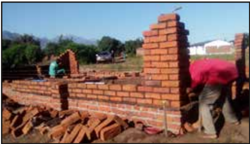
Bakery under construction

There has been an exciting development with a grant being received to start a bakery. The bakery will employ four people; two cooks, a sales person and a security guard. Not only will their goods be for sale at the shop, but also at local markets around the district. This creates an opportunity for employment for the deaf and the profits will go towards the ministry in Malawi.