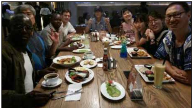
Right: Korean mission team