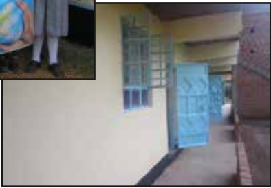
Below: Repainted buildings