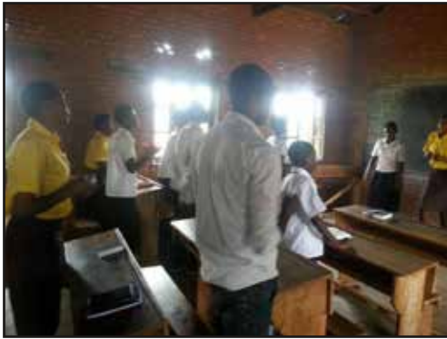
Visiting students in schools

Deaf Action Burundi continues to share the word of God throughout many regions in their country. Part of their recent program has been to visit Deaf children in three different regions. During this period they were able to minister to 450 children with the hope that they will now know a little more of Jesus' love.