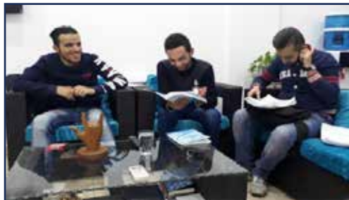
Studying at the Deaf Centre

The deaf centre has created an environment where the deaf can come together to learn skills, sign language and build relationships. This centre also gives opportunities to share the gospel with the deaf in the Damascus community. Please continue to keep this faithful team in your prayers.