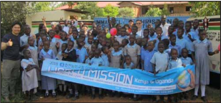
Left: Korean team with students

The South Korean team that visited Uganda, also had the opportunity to visit the Immanuel School and Church for the deaf in Kenya. They blessed the deaf community with gifts of clothing and purchasing a water tank for the school. They also repainted parts of the school for which the teachers and students were very grateful.