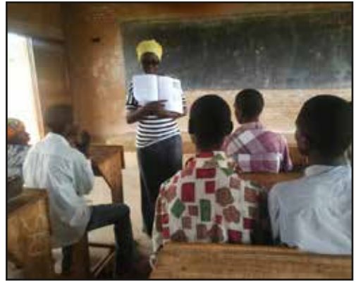
Teaching the youth

In the Bubanza province, there are a number of deaf youth; they have never had the opportunity of education, or employment. The Deaf Action