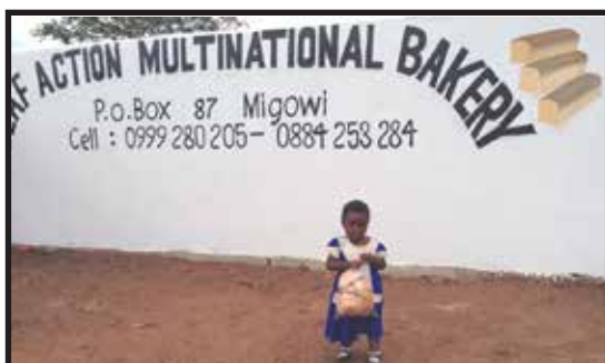
Right: Little girl in front of bakery wall

the surrounding communities, DMI evangelists were able to share the gospel with them in their homes, resulting in twelve people giving their life to Christ. We praise God for these dedicated ambassadors for Christ.