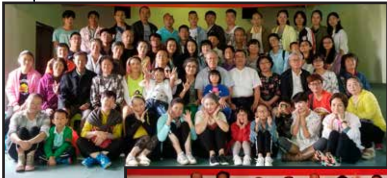
Left: Chinese church celebrating 15th anniversary

One of the evangelists travelled great distances across the country in order to share the gospel with the deaf. The gatherings were times of great fellowship through games, song, prayer and teaching. Please pray for these people as they share the love and promises of Jesus in a country where Christianity is not accepted.