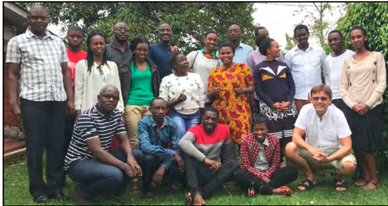
Father Heart Rwanda