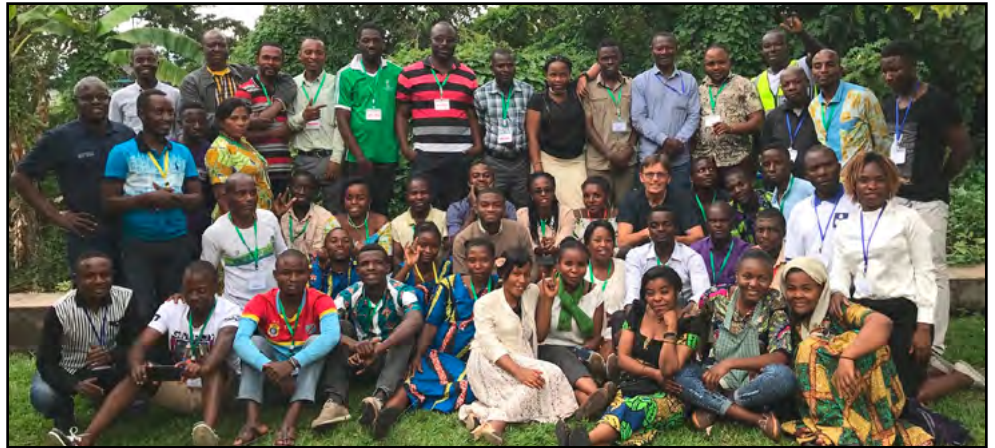
Father Heart The Congo