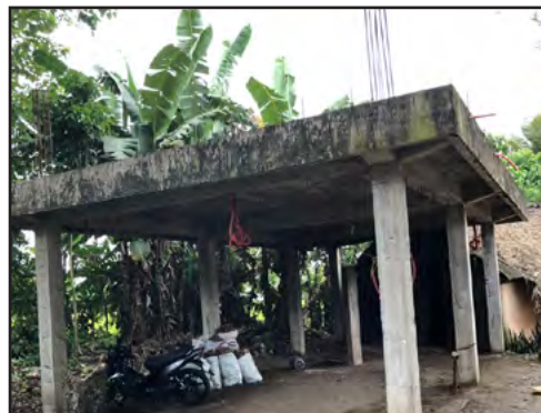
Current construction of the Kitchen