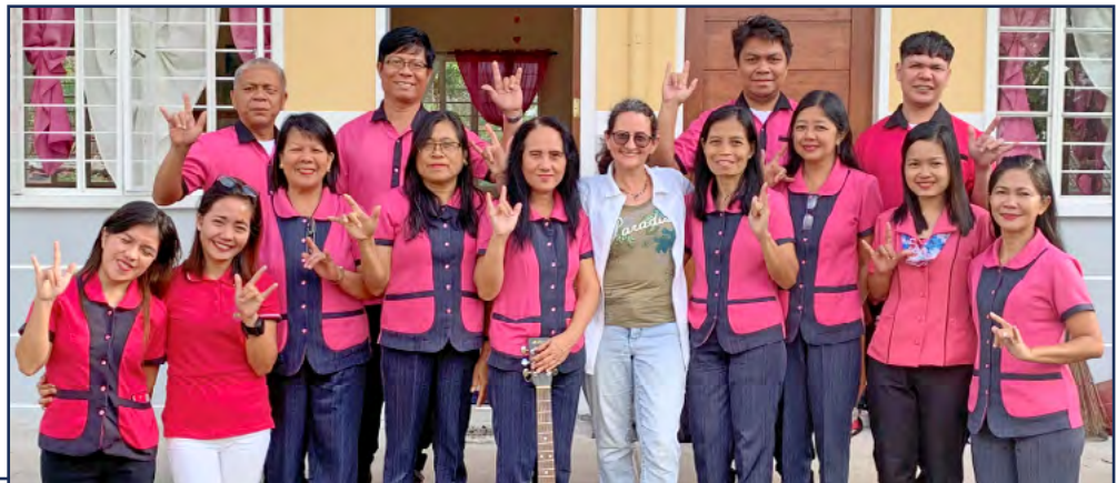
Teachers ready for students

In spite of all the disasters, life goes on in the Philippines. Bit by bit the school is being put together following the typhoon which hit just before Christmas. Roofs are being fixed, buildings rebuilt, the mess cleaned up and classes are back. There is still no electricity and communication is a bit difficult. They have to go into the Ligao township to send messages to us. The spirit