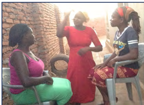
Teaching sign language

The church in Malawi has been growing! They've had deaf attend who do not know any sign language. This has created an amazing opportunity for the church members to teach sign language and the gospel at the same time. It has also meant that these people are now able to communicate with their family and friends, some for the first time.