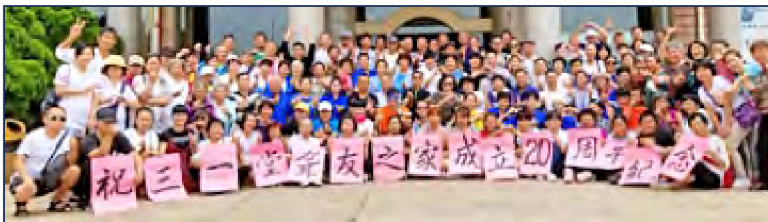
20th anniversary celebrations

It's getting harder and harder for our team in China to freely share the gospel and for us to support them financially. The government is watching peoples' travel and bank accounts very closely. Any travel abroad and funds coming in from outside the country, are thoroughly checked.