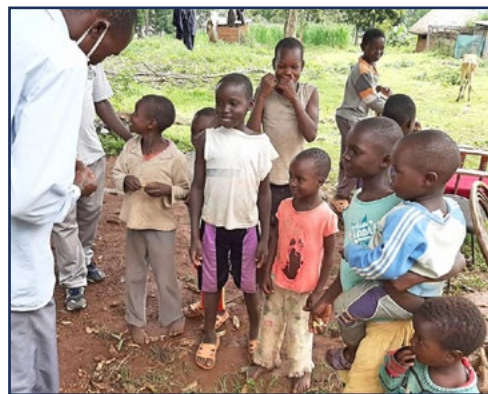
Medical check before lock-down restrictions

Covid-19 is both a health and economic emergency which has negatively affected DMI Kenya Board members, workers, Church members and their families. Some have lost their source of income since the Government announced some measures such as staying at home, prohibiting social gatherings, partial curfew and restrictions of movement from one county to another. Most of the Deaf here in Kenya are very vulnerable. This pandemic has resulted into a crisis within the families since most of them are now unable to pay their house rents and feed their families. The situation is getting worse as some house owners/landlords threaten to evict the Deaf tenants. Even the Deaf are forced to change their daily meal plan by taking one or