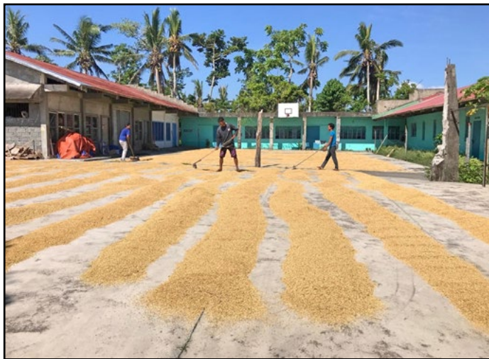
Drying rice on school basketball courts