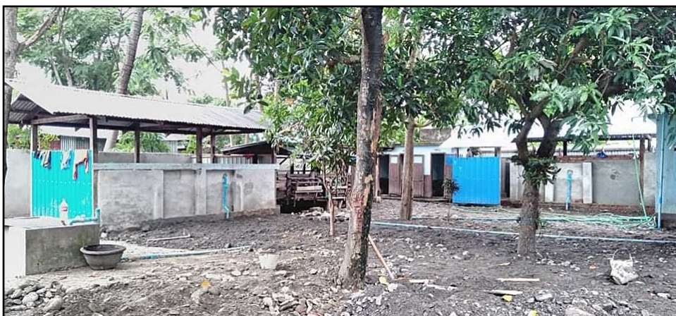
Myanmar - bathrooms

Thank you to the sponsors who have paid their sponsorship for 2020 because the students did attend school earlier in the year and money was needed for building changes. Classes might start again in October but we do not know yet. Most families had sufficient food because many families live on farms in the Kalay area and can grow their own food, especially rice.