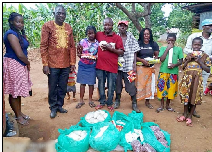
Uganda - Food gifts

to feed their children are extremely grateful to all our supporters.