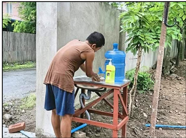
Myanmar - handwashing at the gate

Government rules about returning to school are different in each country. All our schools are trying to continue education in some way, but no schools are fully open.