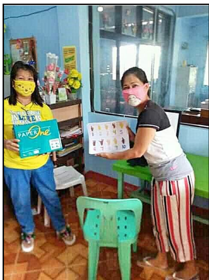
Teachers printing work sheets

The schools in the Philippines were allowed to start 'learning from home' in July, but most of our families do not have home computers! This means the teachers worked at school wearing masks where they printed work sheets and made 'Learning Modules' for students at home. They have been very busy and are very tired because it has meant much more work for them. The Philippine Education Department also had demanding "reporting requirements" that teachers had to send to the government online. We are very grateful to the Directors and teachers for their many hours of work at school!