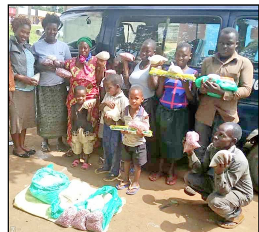
Uganda - St Mary's school receiving food gifts

FOOD APPEAL money and gave food to these families. Some children had to stay at St. Mary's School in Uganda. They were cared for by the headmistress and teachers who live at the school! So, THANK YOU again for your special donations for Food Emergency.