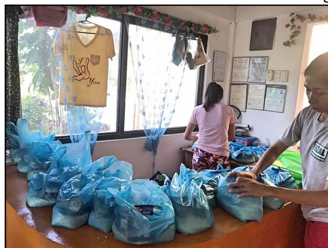
Philippines - Ligao food gifts

Some grandmothers who have full care and responsibility for their deaf grandchildren were in tears of thanks. Our deaf families who are struggling