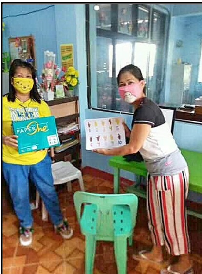
Teachers printing work sheets

The schools in the Philippines were allowed to start 'learning from home' in July, but most of our families do not have home computers! This means the teachers worked at school wearing masks where they printed work sheets and made 'Learning Modules' for students at home. They have been very busy and are very tired because it has meant much more work for them. The Philippine Education Department also had demanding "reporting requirements" that teachers had to send to the government online. We are very grateful to the Directors and teachers for their many hours of work at school!