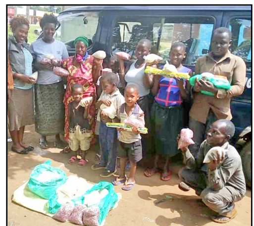
Uganda - St Mary's school receiving food gifts

FOOD APPEAL money and gave food to these families. Some children had to stay at St. Mary's School in Uganda. They were cared for by the headmistress and teachers who live at the school! So, THANK YOU again for your special donations for Food Emergency.