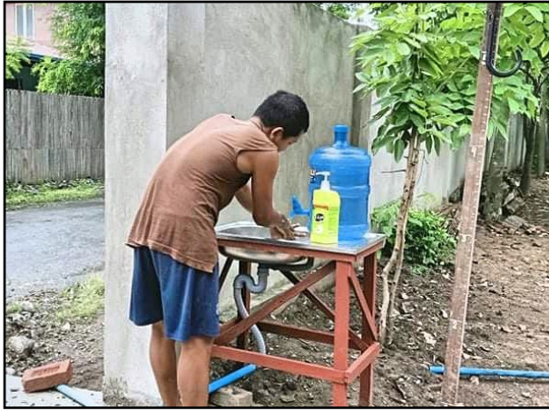
Myanmar - handwashing at the gate

Thank you to the sponsors who have paid their sponsorship for 2020 because the students did attend school earlier in the year and money was needed for building changes. Classes might start again in October but we do not know yet. Most families had sufficient food because many families live on farms in the Kalay area and can grow their own food, especially rice.