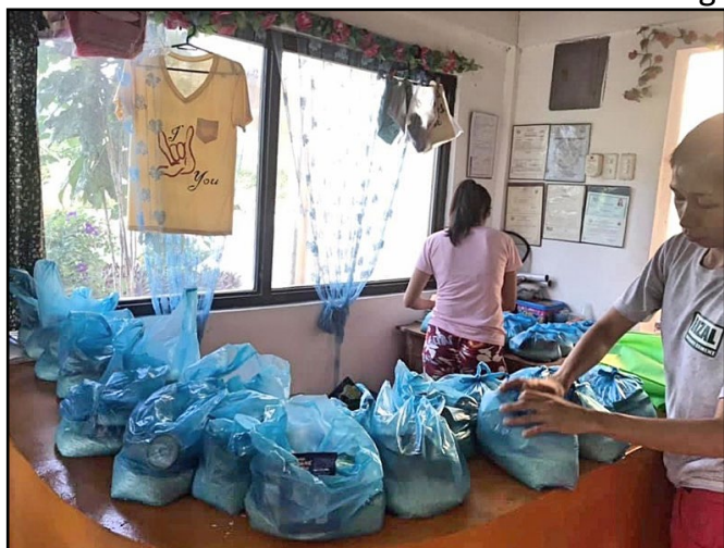
Philippines - Ligao food gifts

The cost of food in Kenya, Uganda and The D.R. Congo increased greatly last March when outdoor markets were suddenly shut down. Most of our deaf families cannot afford to go to supermarkets! Some of our students even walked long distances back to school by themselves to ask for food! The farm at Ligao in the Philippines has also provided bags of rice, coconuts, chickens and plant crops from the harvest for the needy families there. Now, 6 months later, many people still have no work during this pandemic and cannot afford to buy food.