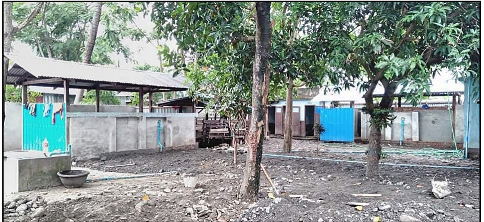
Myanmar - bathrooms

Muir School, in MYANMAR re-started in July and continued for 2 months until the end of August when the government closed it again due to a 2nd coronavirus wave! Temperature taking and hand sanitation were needed at the entrance gate of the school, and in the kitchen and dining room! The school was told to build another bathroom and toilet and make other changes to buildings! Boys' and girls' dormitories have been swapped, so now the boys have the big dormitory and the children are not too close together when sleeping.