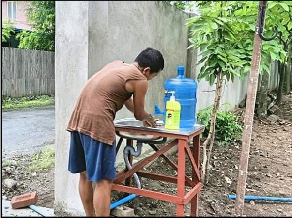
Myanmar - handwashing at the gate

Thank you to the sponsors who have paid their sponsorship for 2020 because the students did attend school earlier in the year and money was needed for building changes. Classes might start again in October but we do not know yet. Most families had sufficient food because many families live on farms in the Kalay area and can grow their own food, especially rice.