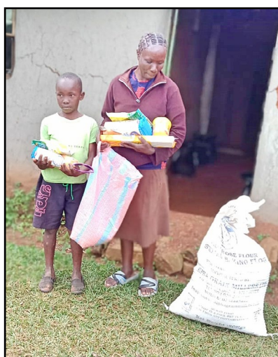
Kenya - Food gifts food gifts.

We are very grateful to everyone who continued their donations even though the schools closed in April. Money has been needed to buy food for our deaf families. Thank you also to those who gave donations specifically for food.