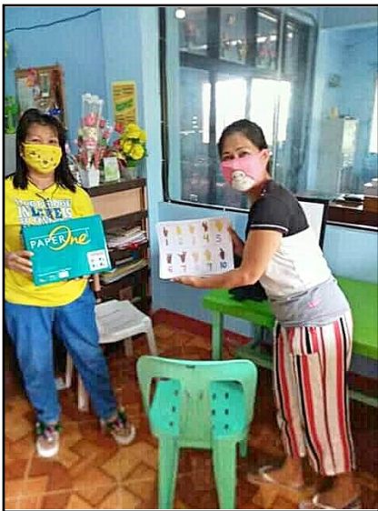
Teachers printing work sheets

The schools in the Philippines were allowed to start 'learning from home' in July, but most of our families do not have home computers! This means the teachers worked at school wearing masks where they printed work sheets and made 'Learning Modules' for students at home. They have been very busy and are very tired because it has meant much more work for them. The Philippine Education Department also had demanding "reporting requirements" that teachers had to send to the government online. We are very grateful to the Directors and teachers for their many hours of work at school!