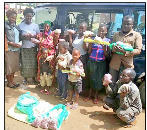
Uganda - St Mary's school receiving food gifts

FOOD APPEAL money and gave food to these families. Some children had to stay at St. Mary's School in Uganda. They were cared for by the headmistress and teachers who live at the school! So, THANK YOU again for your special donations for Food Emergency.