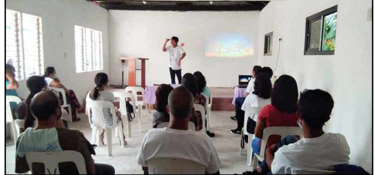
New church building

services throughout the Easter period. And from April, in-person services have resumed with COVID restrictions. We praise God for all these developments.