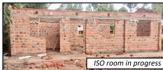
ISO room in progress

The Exam Class with the Principal and Deputy Principal, and a government teacher who will oversee the exam