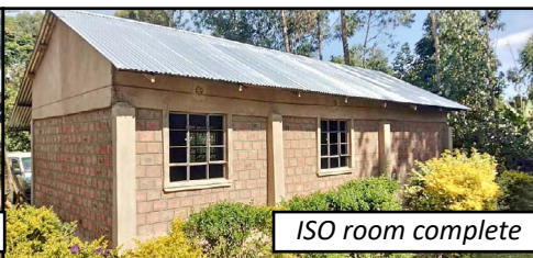
ISO room complete