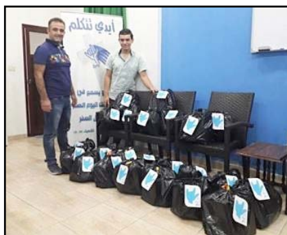
Food and aid packages