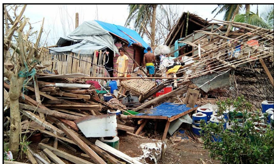
Damage after the typhoon

Our Ligao school and church have seen a number of developments over the last few months. In late October, super typhoon Rolly- the strongest landfalling tropical cyclone on record - devastated much of the Philippines. Our church compound (now inside the school grounds) in Ligao was not spared and a huge mop up job began. Praise God we were able to send over $10,000 to help. There was a wonderful community spirit in the clean up as the photos show. Much of the damage has now been repaired and the compound is starting to look its paradisiacal self again! After all that water falling down, the Ligao school then had a problem with the water coming up! Their vital Deep Well