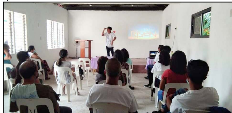
New church building

son services have resumed with COVID restrictions. We praise God for all these developments.