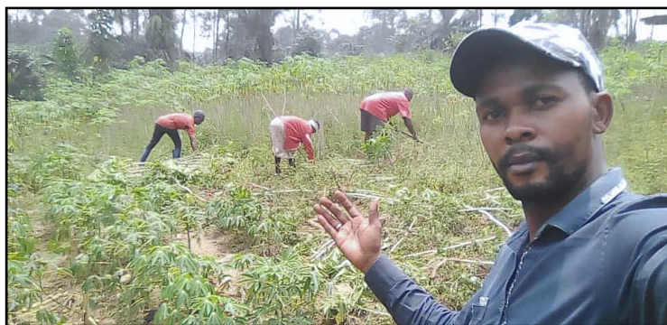
New farm land

students with food for lunches, but an opportunity for student to learn how to plant, grow and harvest crops, skills that will be of great benefit in the future.