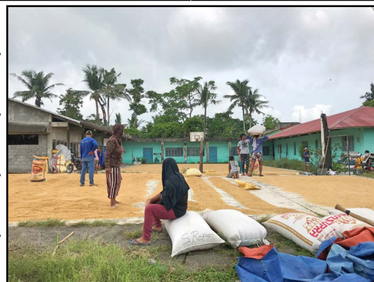
Drying harvested rice