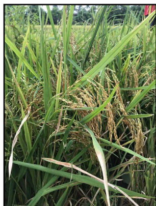
Rice ready for harvest