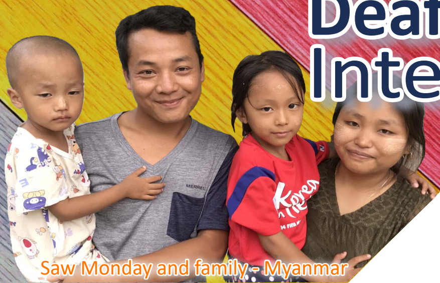
Saw Monday and family - Myanmar