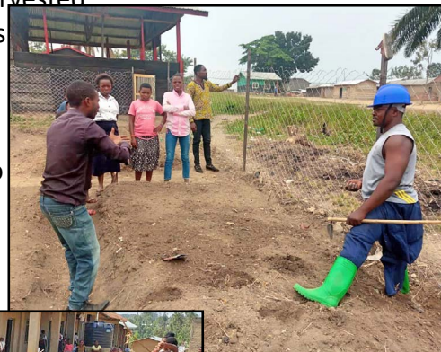
Above: Teaching the students to plant vegetables Left: Students beating dry beans from stems.

DMI will support this initiative financially until the end of the year with the hopes that it will be able to fully support itself after that.