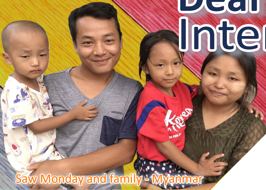
Saw Monday and family - Myanmar