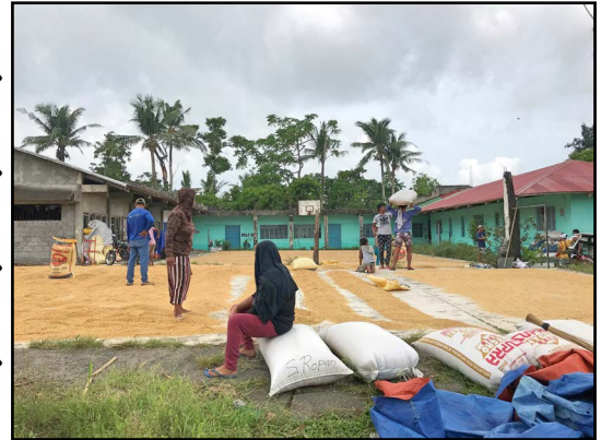
Drying harvested rice