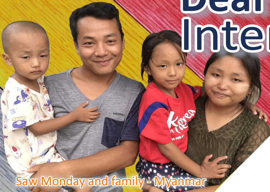
Saw Monday and family - Myanmar