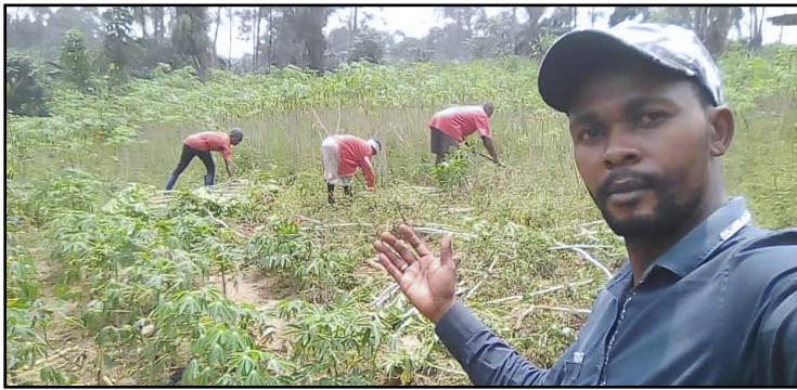
New farm land

students with food for lunches, but an opportunity for student to learn how to plant, grow and harvest crops, skills that will be of great benefit in the future.