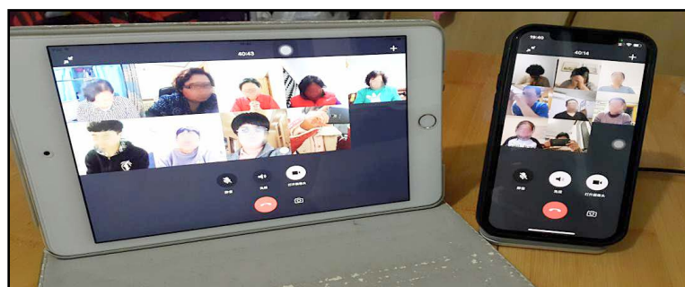
Bible study online

news of Jesus at the best of times, so Covid has added extra challenges to contend with. Their job is not easy, but God has continued to protect them and they have found ways to gather together to study God's word, even if it's not in person. A few churches have been able to have Bible studies online and one church managed to meet once in person at a park. Prayer has been requested for God to give them wisdom on how to reach the younger generation of Deaf. Also let's continue to pray for the protection of those ministering to the Deaf in China. The circumstances are difficult with lack of freedoms that many of us will never experience.