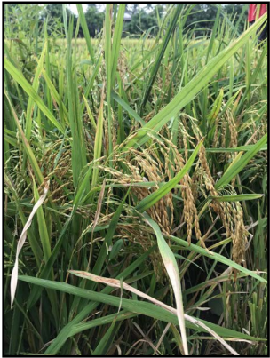
Rice ready for harvest