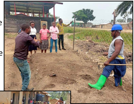
Above: Teaching the students to plant vegetables Left: Students beating dry beans from stems.

DMI will support this initiative financially until the end of the year with the hopes that it will be able to fully support itself after that.