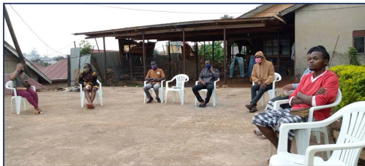
Father Heart conference

The Bible school commenced its academic year on April 7th after their lockdown was lifted. The new year brought two new enrolments: a male from Zambia and a female from D.R.Congo, bringing the current number of students to 10. The school is running with Ugandan COVID restrictions in place, doing their best to ensure the students' safety. The