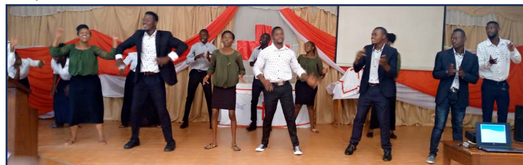
Last service before lockdown

Please keep our Ugandan DMI family in your prayers as they navigate this long period of lockdown. Many are struggling but we know that our God is bigger than all the struggles they face.