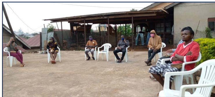
Father Heart conference

The Bible school commenced its academic year on April 7th after their lockdown was lifted. The new year brought two new enrolments: a male from Zambia and a female from D.R.Congo, bringing the current number of students to 10. The school is running with Ugandan COVID restrictions in place, doing their best to ensure the students' safety. The