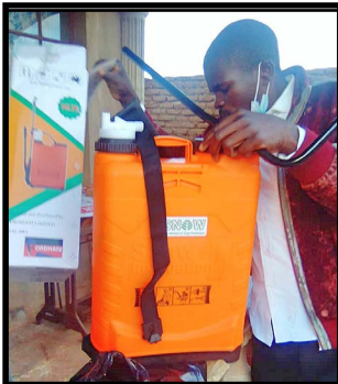
Unpacking new equipment

Our workers in Malawi have been doing a wonderful job with very limited resources and under very difficult circumstances. They have been active in distributing food to the Deaf. They have grown their church through door-to-door evangelism and have trained some newly Deaf people how to sign. They have also made a super start on their new farming project.