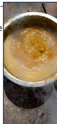
Making palm oil

At the time of writing this, Uganda is 42 days into a 72-day lockdown. Some restrictions have eased very slightly but the government has stated that schools must remain closed until they have reached sufficient vaccination numbers.