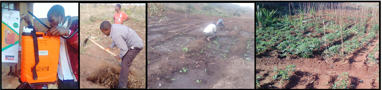
Unpacking new equipment

Our workers in Malawi have been doing a wonderful job with very limited resources and under very difficult circumstances. They have been active in distributing food to the Deaf. They have grown their church through door-to-door evangelism and have trained some newly Deaf people how to sign. They have also made a super start on their new farming project.