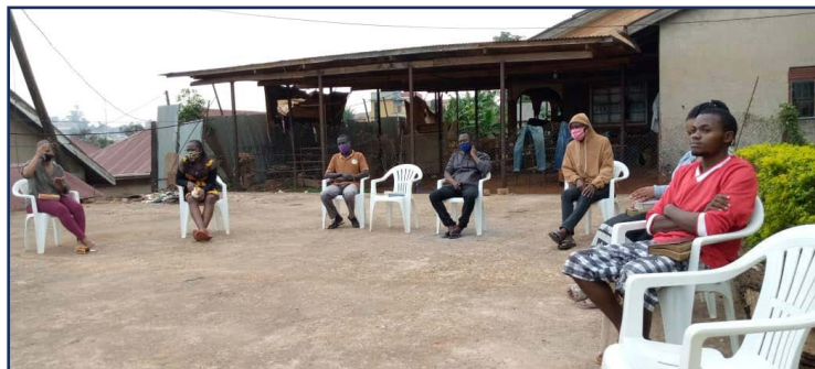
Father Heart conference

The school is running with Ugandan COVID restrictions in place,