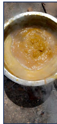
Making palm oil

At the time of writing this, Uganda is 42 days into a 72-day lockdown. Some restrictions have eased very slightly but the government has stated that schools must remain closed until they have reached sufficient vaccination numbers.