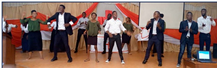
Last service before lockdown

of Ugandans unable to afford food. Thankfully, we were able to send food emergency funds to our Evangelists and church members. Those that received this blessing are so thankful as they had no idea where their next meal was coming from. Please keep our Ugandan DMI family in your prayers as they navigate this long period of lockdown. Many are struggling but we know that our God is bigger than all the struggles they face.