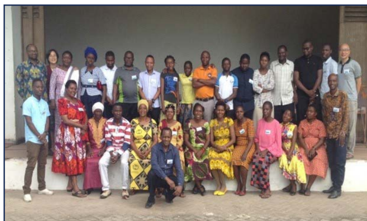
Father Heart conference

Despite Daniel's absence, the ministry has been in full flight. COVID restrictions have been minimal at this stage. A new church was planted and over 100 people attended the grand opening. They have run several workshops on leadership, marriage and relationships, and have conducted baptisms. Over all,