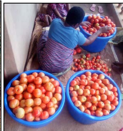
Bountiful first harvest