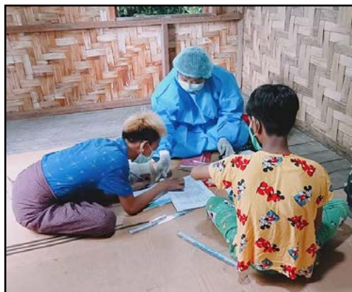
Teachers in students' homes wear medical protective clothing while teaching.