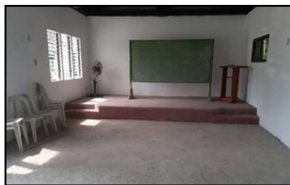
New church building