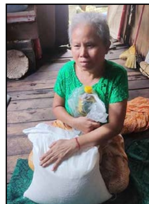
Elderly woman from Yangon church congregation receiving food relief.