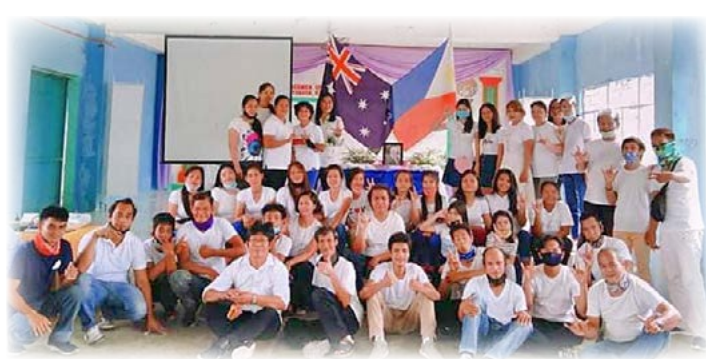
Memorial Service Ligao, Philippines