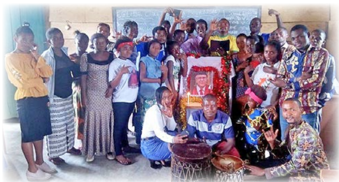
Memorial Service, Beni D.R.Congo