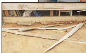
Above: New storage building Left: Kitchen break-in