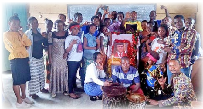
Memorial Service, Beni D.R.Congo