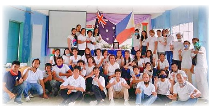
Memorial Service Ligao, Philippines