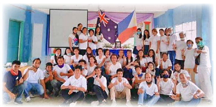
Memorial Service Ligao, Philippines