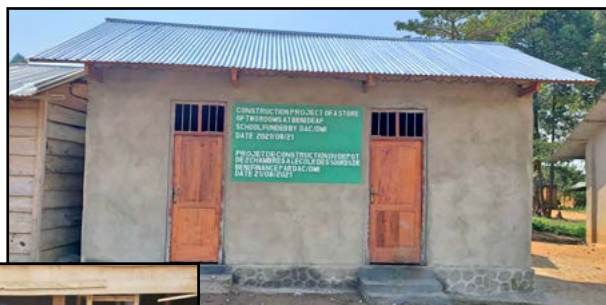
Above: New storage building Left: Kitchen break-in

earlier this year thieves broke into the kitchen by removing boards from the kitchen walls; and stole their food! So a strong brick and concrete storeroom has been built to store the produce from the school garden and farm.