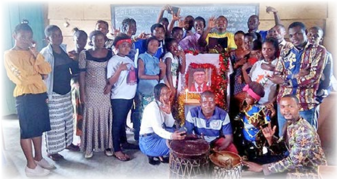
Memorial Service, Beni D.R.Congo