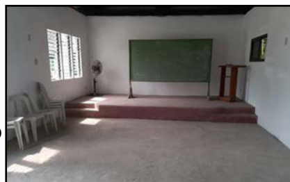
New church building