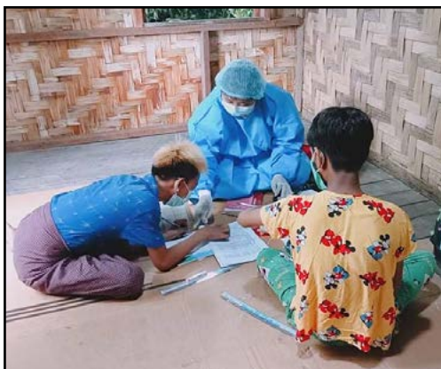
Teachers in students' homes wear medical protective clothing while teaching.