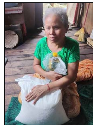
Elderly woman from Yangon church congregation receiving food relief.