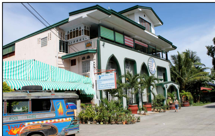
Davao school building

This has been a challenging time for DMI and for the Asuela family, but we know that all things work for good for those who love the Lord. Your continued prayers are precious.