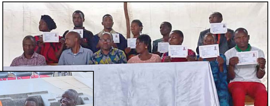
DAT leaders with those who were baptised in Mbeya