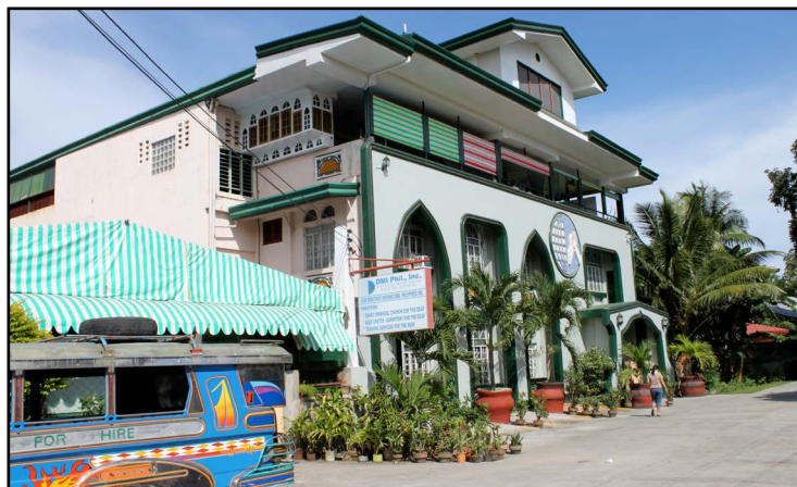
Davao school building

This has been a challenging time for DMI and for the Asuela family, but we know that all things work for good for those who love the Lord. Your continued prayers are precious.