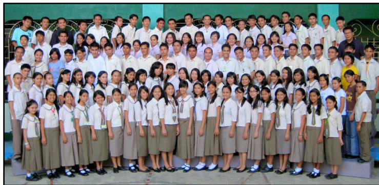
Davao students 2008

The faith of the Deaf believers in Ligao is strong. Members continue to meet and pray together via Zoom meetings as well as face-to-face for Sunday worship.