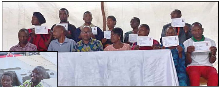
DAT leaders with those who were baptised in Mbeya