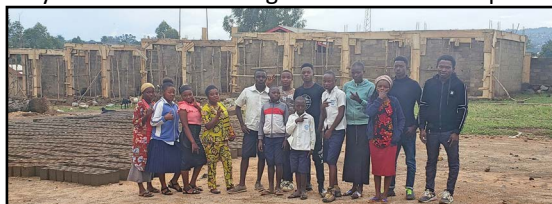
"To be" secondary students in front of new buildings