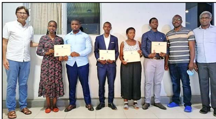
Newly ordained Pastors in Rwanda