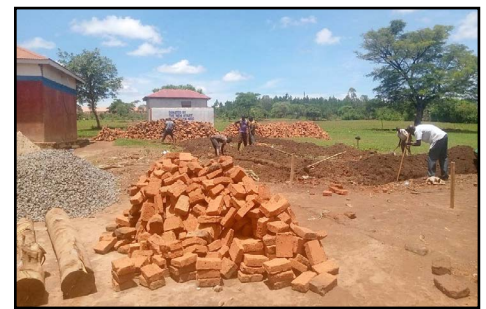
Foundations for new classrooms

classes were being held outside which was problematic on rainy or windy days. The new classrooms allow students to learn in a safe, effective and compliant way.