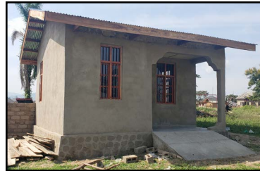
(Left) Classroom construction. (Middle) Completed secondary school office.