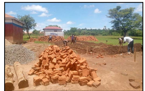
Foundations for new classrooms

classes were being held outside which was problematic on rainy or windy days. The new classrooms allow students to learn in a safe, effective and compliant way.