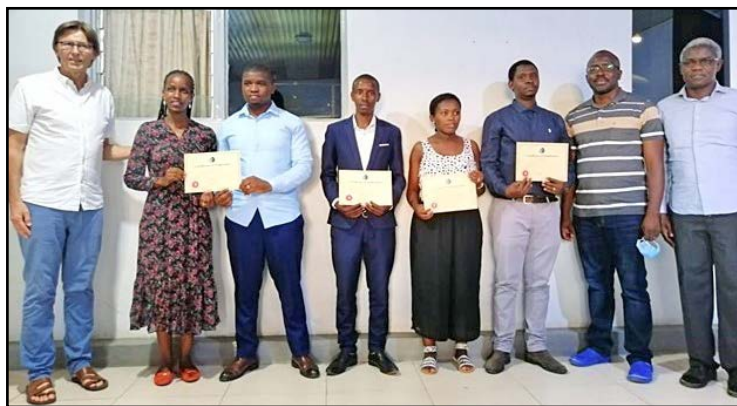
Newly ordained Pastors in Rwanda