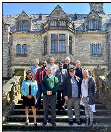
NY Lutheran Deaf Conference

In Los Angeles, I met with our partners at Huntington Beach, met with missions teams from three new churches (ranging in size from 60 members to 12,000!) and gave a DMI-tinged sermon at The Garden Church. Each church received me warmly and I look forward to DMI developing partnerships with them in the coming months and years.