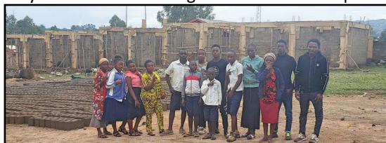
"To be" secondary students in front of new buildings