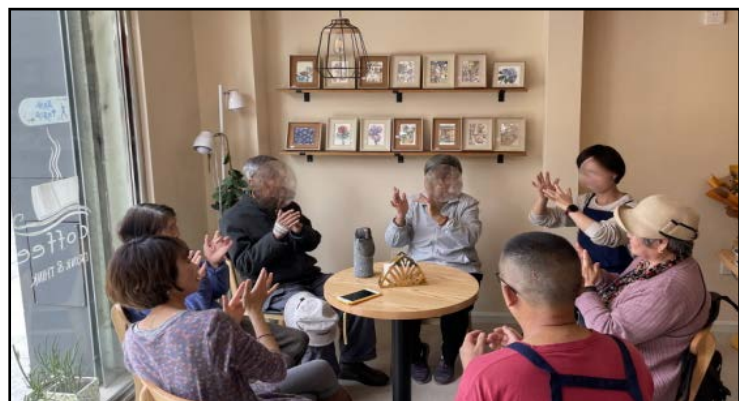
Prayer meeting at the cafe. (Faces have been blurred for safety reasons)

Churches are still meeting online or in parks. Whether they are able to meet online or in person, prayer meetings have never stopped regardless of the situation. In the words of one of our Chinese workers "Praise Lord, we still can worship Him now!"