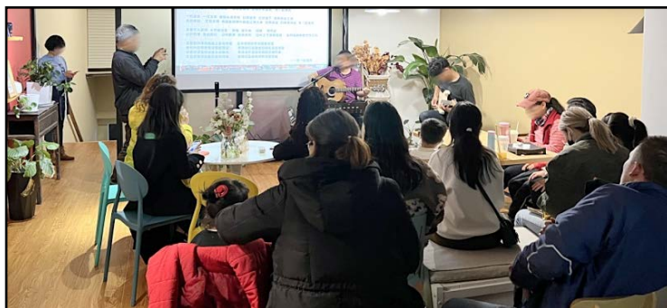
Praise and worship at the cafe