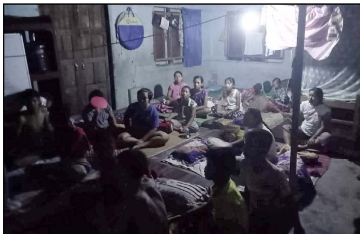
Students and teachers hiding in the darkness

Among them are 5 new students. The children were so happy to be back at school after having to shut the doors over 2 years ago, firstly due to COVID and then because of all the political unrest.