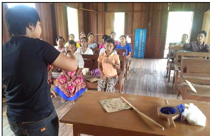
Pindaw Oo Church near Kalay

960kms away in Kalay, where the Neville Muir School for the Deaf is situated, the circumstances are quite different. There is