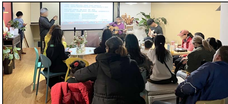
Praise and worship at the cafe