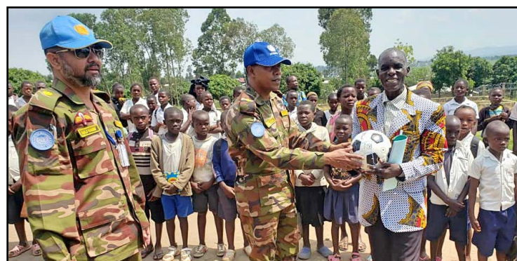
Students receiving new sports equipment

The students received new school bags, exercise books and note pads, school uniforms, soccer team uniforms and boots and sports materials. They also received donations of 54