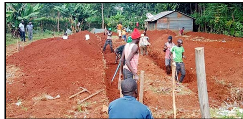
Digging the foundations