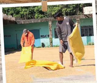
Ligao, Philippines Rice harvest.