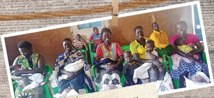
Uganda Breastfeeding mothers receiving food.