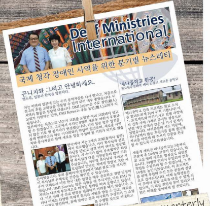
We now have a quarterly DMI Korean newsletter that can be found on our website.