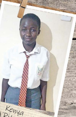
Kenya Rita's story features in Andrew's latest blog on the website