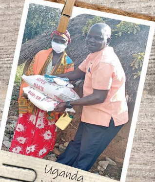
Uganda Widow receiving food Package.