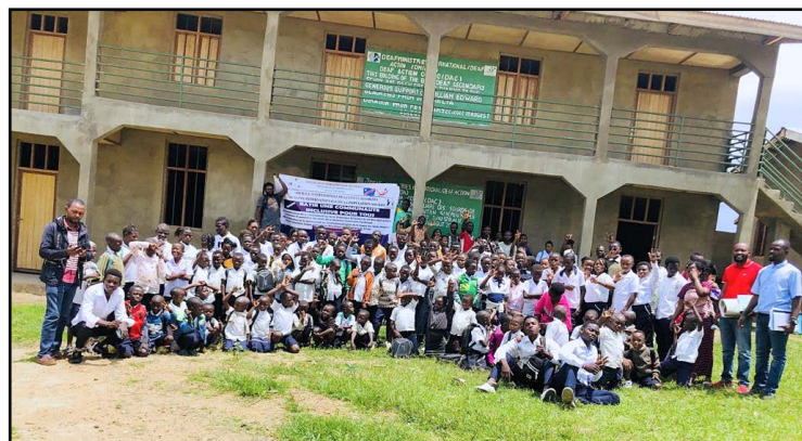
Students and Staff in front of new building.