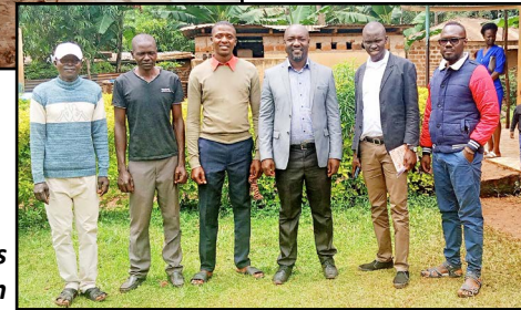
Parents and Teachers Association