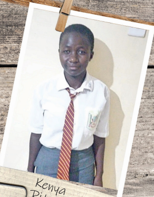
Kenya Rita's story features in Andrew's latest blog on the website