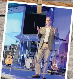
USA Andrew speaking at the Garden Church in Los Angeles last month.