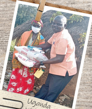
Uganda Widow receiving food package.