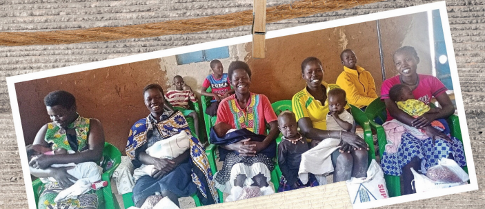
Uganda Breastfeeding mothers receiving food.