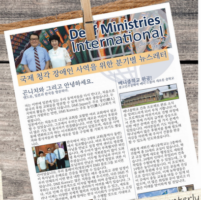
We now have a quarterly DMI Korean newsletter that can be found on our website.