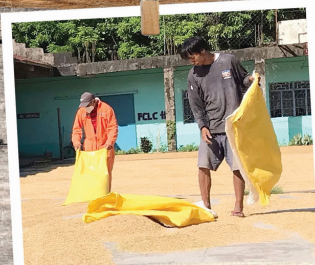
Ligao, Philippines Rice harvest.