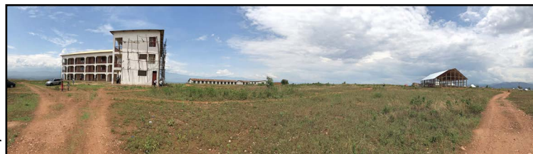
Burundi National Institute for the Deaf.