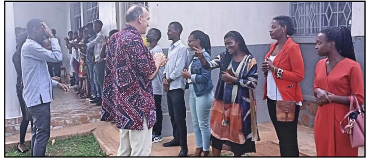
'Passing of the Peace'