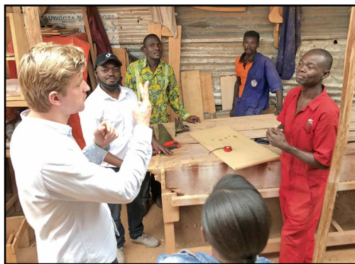
MREDF Carpentry business.