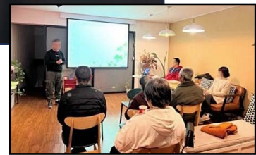
Faces have been blurred for security purposes