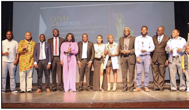
Receiving Media Film Award

Our Immanuel Churches of the Deaf have also won a Kenya Media Film Award for the best faith-based vlog postings in all of Kenya! Vlog postings on social media include Deaf praise and worship and preaching.