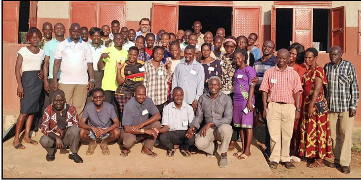
The school in Lira has really been a blessing!