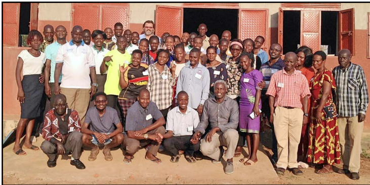
The school in Lira has really been a blessing!