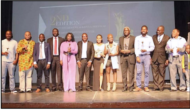
Receiving Media Film Award

Our Immanuel Churches of the Deaf have also won a Kenya Media Film Award for the best faith-based vlog postings in all of Kenya! Vlog postings on social media include Deaf praise and worship and preaching.