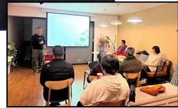
Faces have been blurred for security purposes