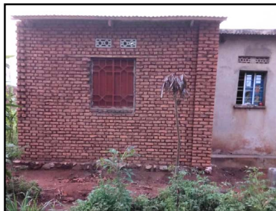
New storge building

We're thankful that the soybean and sorghum harvests at the new self-sustainability fields in Burundi have been abundant. The bean and maize harvests were not as good because of the timing of the rains and because of those pesky hippos that sometimes come out from the Rusizi river