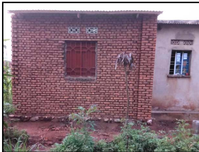
New storage building

we will focus on sorghum and soybeans as these are better suited to our fields.