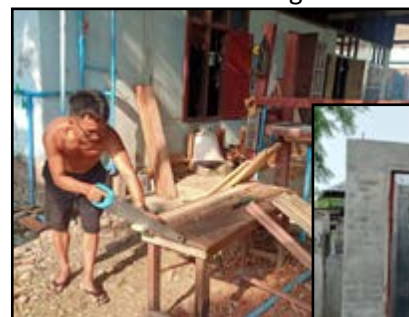
Left: making table and chairs Below: new toilets

After months of fierce battles, we have finally received news of the church in Pyindaw Oo in the far north of the country. Most of the villagers have fled, some into India and some into Kalay. Despite gunshot and fire damage to many buildings in the area, our church building has remained untouched! Praise God for His protection. We hope to restart services soon. There have been some good developments at our Muir School