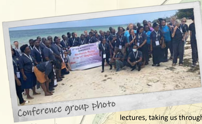
Conference group photo

The 8th DMI International Conference, held in Mombasa, Kenya from August 7-11, brought together 81 delegates from 16 countries, consisting of field workers, staff, supporters and ministry partners. In the comfort of the Mombasa Continental Resort, we were strengthened and encouraged through lectures, presentations, trainings and workshops.