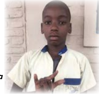
Prince Carmel Nduwimana