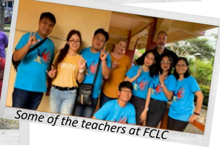
Some of the teachers at FCLC