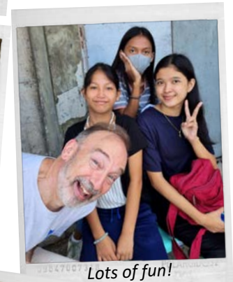
Lots of fun!