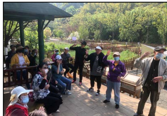
Church in the park

In June, the Te Church for the Deaf was able to celebrate its 17th anniversary. Due to the pandemic, the church's anniversary hadn't been celebrated for two years so members were full of thanks and joy for God's care and protection. The church prayed for continued peace and protection over the churches across China.