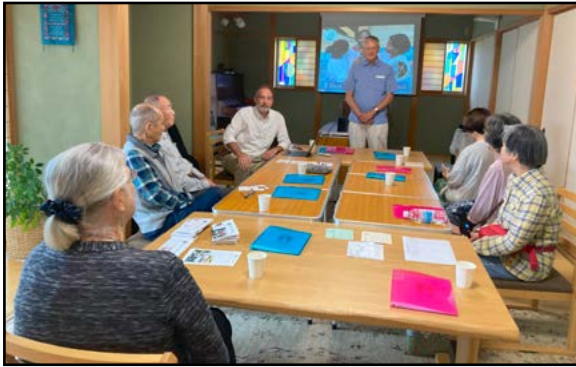
Nagoya house church, Japan