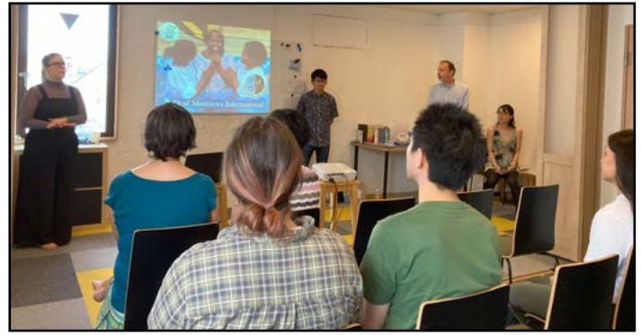
Mustard Seed church, Japan