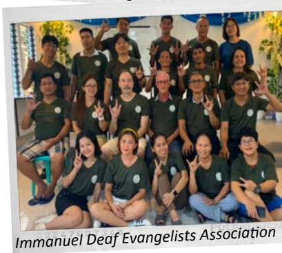
Immanuel Deaf Evangelists Association