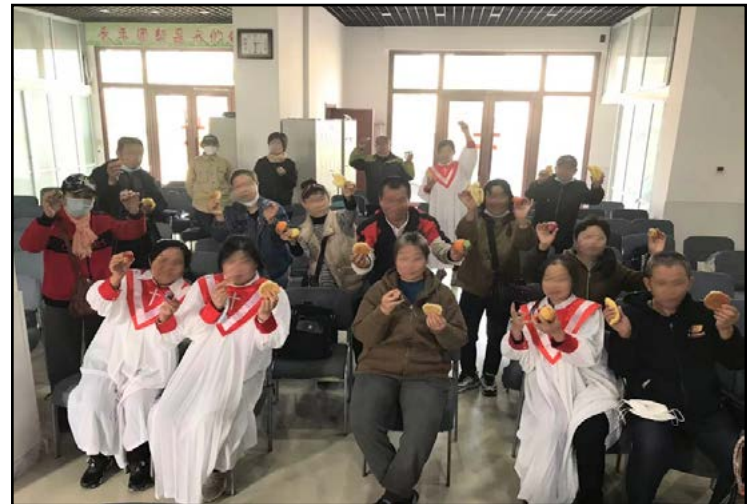
A treat of biscuits, fruit and eggs

They are asking for prayer that God may guide their next steps. Pray for all the Deaf churches in China.