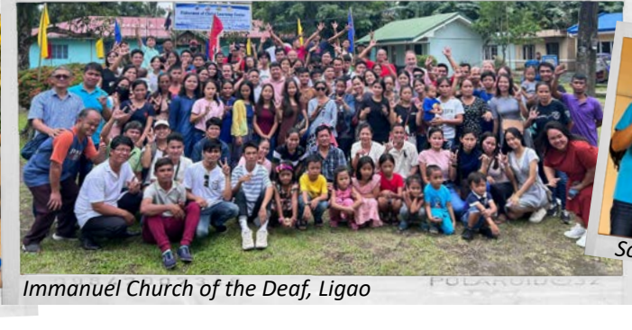
Immanuel Church of the Deaf, Ligao