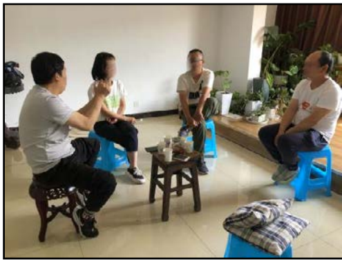
New coffee shop location

Some of our believers from J were travelling together recently. They met a young couple who believed in Jesus but had become disenchanted with their lives. The believers from J witnessed to them and encouraged them in their faith, giving them a Bible. When the couple saw how the believers shared their meals and lives together, they were deeply moved and joined the church that day. They left, we are told, thanking the Lord and renewed in their faith. In K, the church is encountering great difficulties and obstacles.